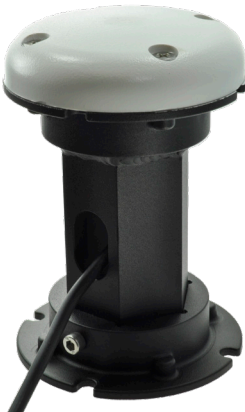
Antenna shown with optional bracket. Bracket allows for mounting on single center 5/8 bolt or four perimeter bolts.

86362 ..... Trimble AV34 Antenna (White) 86362-10 ..... Trimble AV34 Antenna (Black)